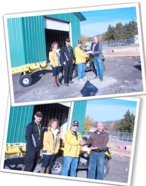
Donation presentations from Encana and Milner Power

Fundraising is always an ongoing process to keep our organization up to date, and we are grateful for the funds received to bring GC SAR to the standard we now enjoy. If you are interested in donating to GC SAR, please visit our web page at http://www.gcsar.ca for contact information.